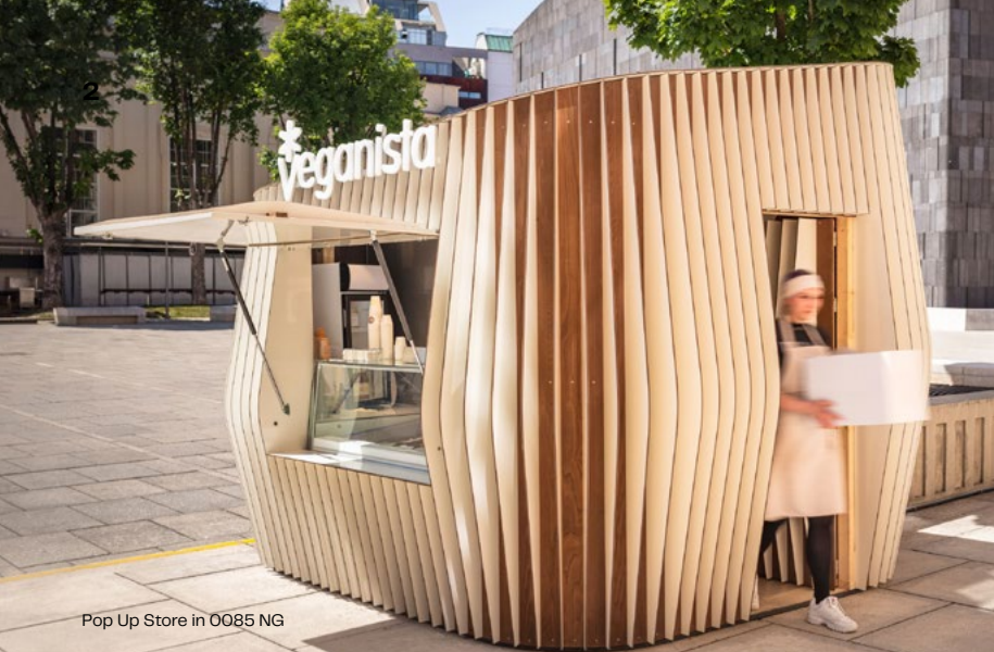
Pop Up Store in 0085 NG