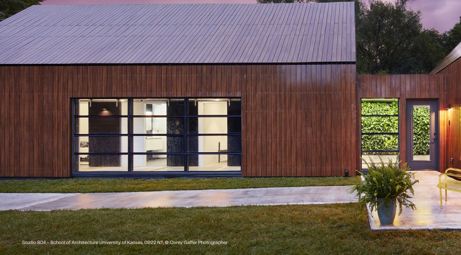
Studio 804 - School of Architecture University of Kansas, 0922 NT, © Corey Gaffer Photographer