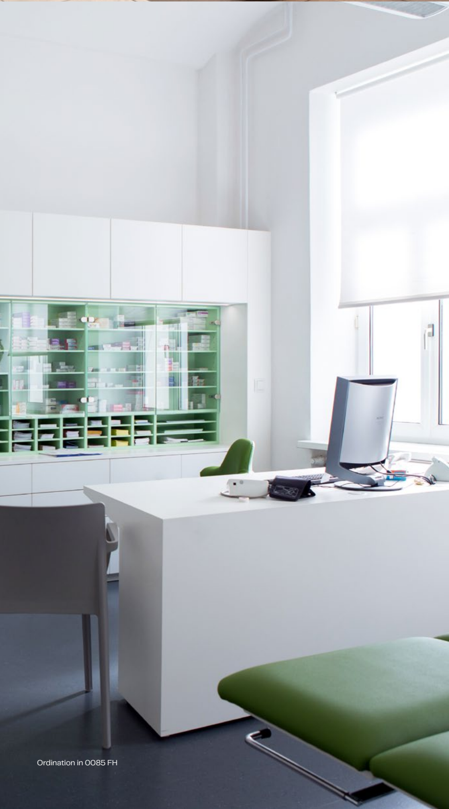
Ordination in 0085 FH