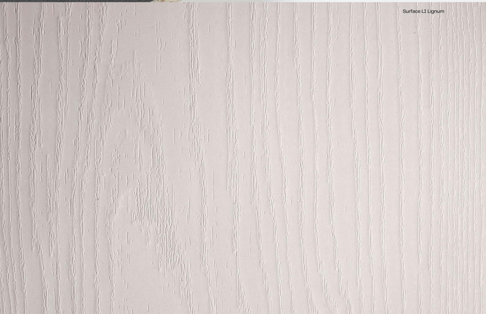
Surface LI Lignum